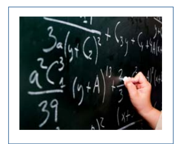
Creating a More Educated Georgia

Do You Know the Criteria for Verifying Eligibility for In-State Tuition? Is Your Institution's Governance Policy in Place?